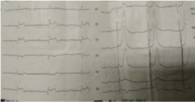
Figure 1: Electrocardiogram showing ST elevation inferior wall myocardial infarction along with bradycardia and complete heart block.