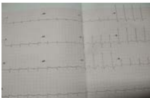
Figure 4: Electrocardiograph showing sinus rhythm.